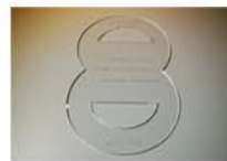
Neck stretch gauge