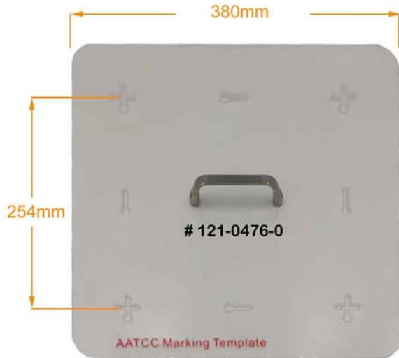
Thick 厚 5 mm

Approved by World Renowned Retailers meeting international standards