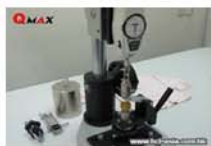
Button Pull Tester