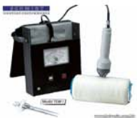
Textile Moisture Meter