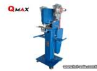
Button Attaching Machine